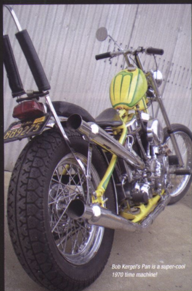
Bob Kergel's Pan is a super-cool 1970 time machine!