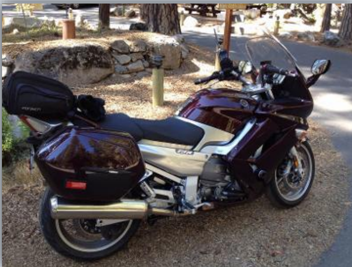
2007 Yamaha FJR 1300