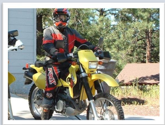
2001 Suzuki DRZ400 Dual Sport