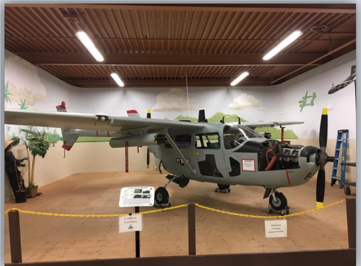
Restored 1968 Cessna 02A Vietnam era observation plane on display at the Travis Air Force Base Heritage Center