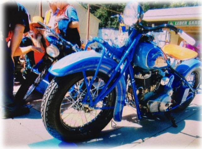
Beautiful 36-39 Indian Chief up for judging