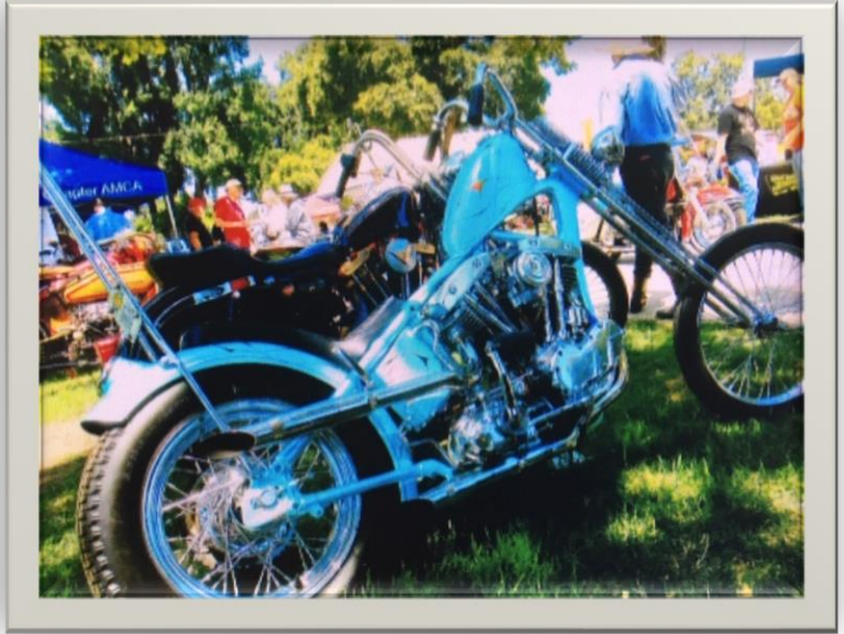
Nice period correct generator H-D Shovelhead Chopper on single leg VL frame.