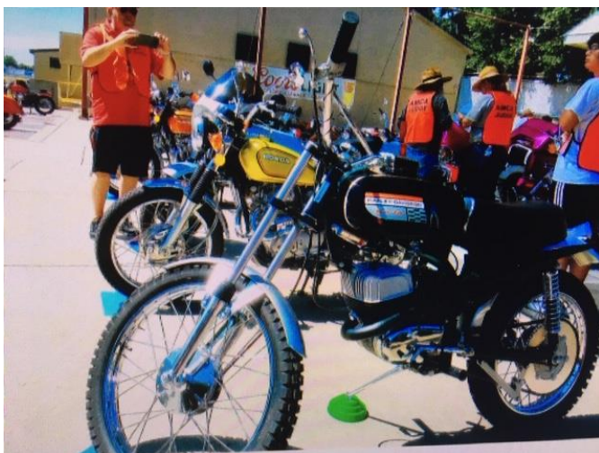
Rare HD 100 Baja being judged