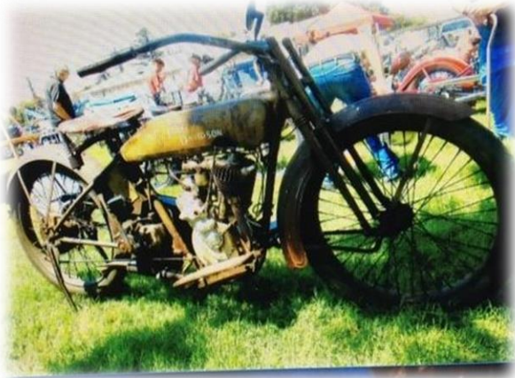
Ultra Race 1917 single cylinder HD