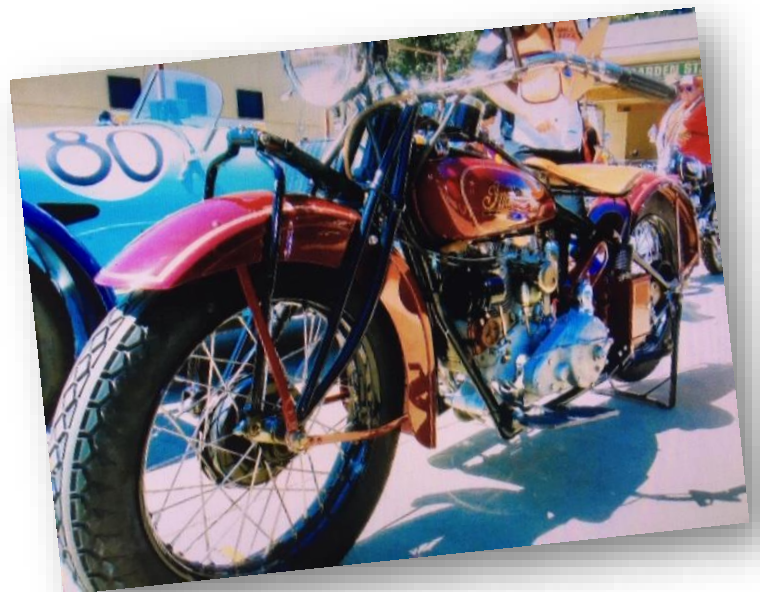
1930 Indian 101 Scout being judged