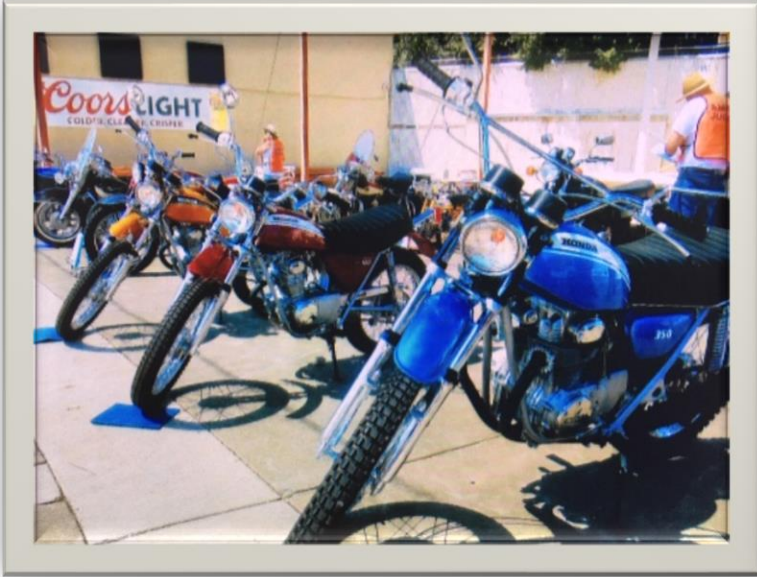
A cool trio of Honda's up for judging