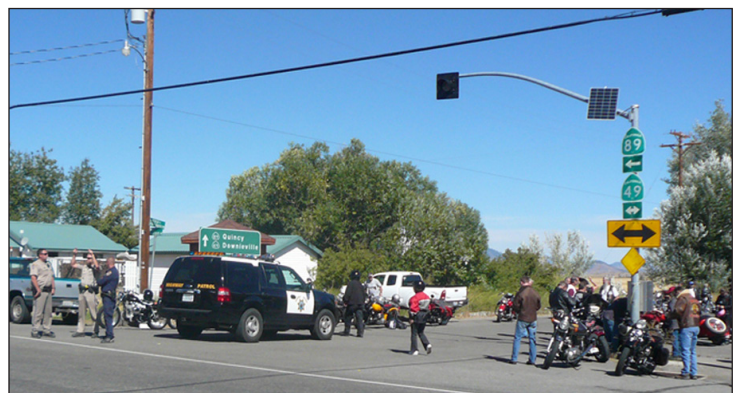
The ride came to an abrupt halt when the Highway Patrol put up a road block just outside Sierraville.