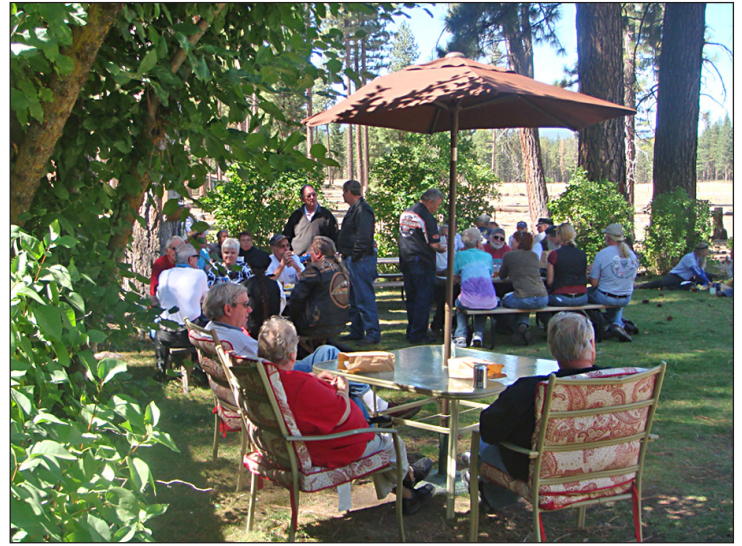
A relaxing lunch break at Graeagle.

by a huge blizzard and were forced to resort to cannibalism before they were finally rescued.