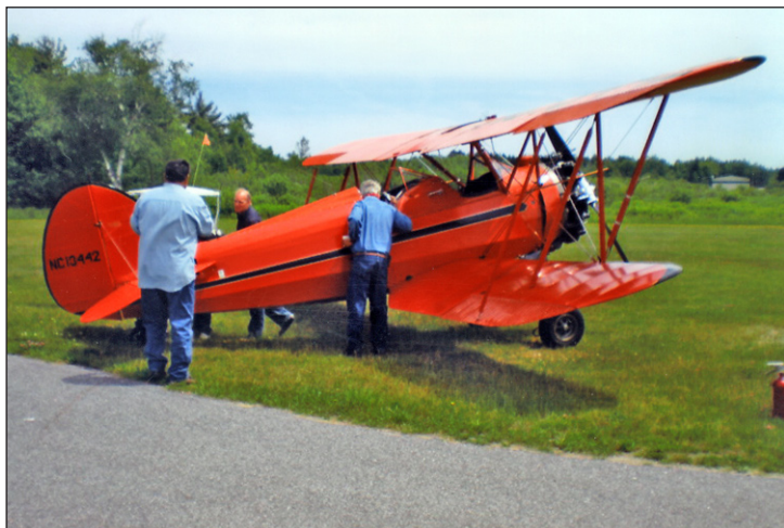
Three of the lucky winners at the road run got to go for a flight in this beautiful Waco biplane

Thursday’s ride topped out on Mount Battie for a spectacular view of Camden, its large harbor, the Maine coast for a hundred miles and out into the Atlantic Ocean. Later we visited the Owls Head Transportation Museum where three lucky winners