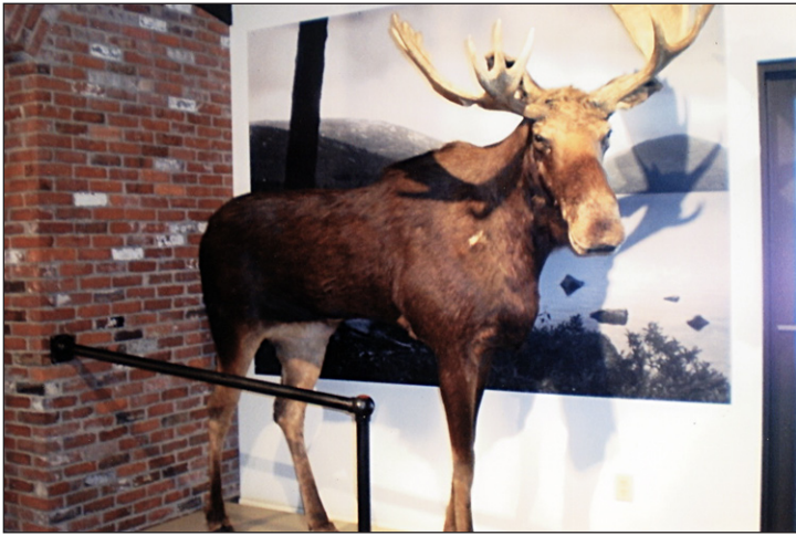
Forget about deer! Look out for these guys in Maine! That railing is three feet tall. Warnings are posted everywhere.

The next day found us at Larry’s for a great dinner and packing for the trip west. Four days later we were back in Sacramento with John having to drive another 1,000 miles north to British Columbia.