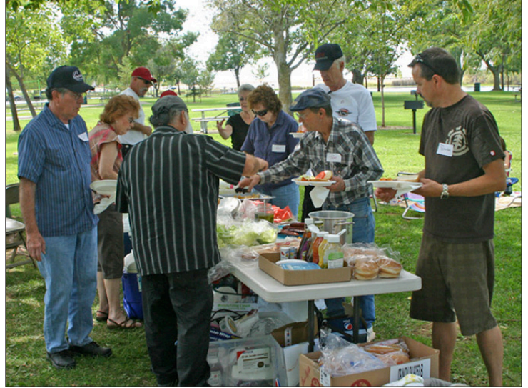
The guests lined up to get 'em.