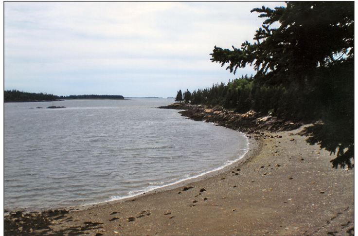
The whole coast looks like this.

Memories are: Fuel costs were half of what they were last year. The “upheavals” are what Mainers call their bad roads and make our potholes feel like new roads. The Mexican restaurant we found by accident on Highway 20 in Cobly, Kansas (town population: 0) is the best I’ve ever eaten in, period. I’d also travel another 6,000 plus miles for a sip of the blueberry ice tea at Barb’s Place just outside of Belfast, Maine—honest!