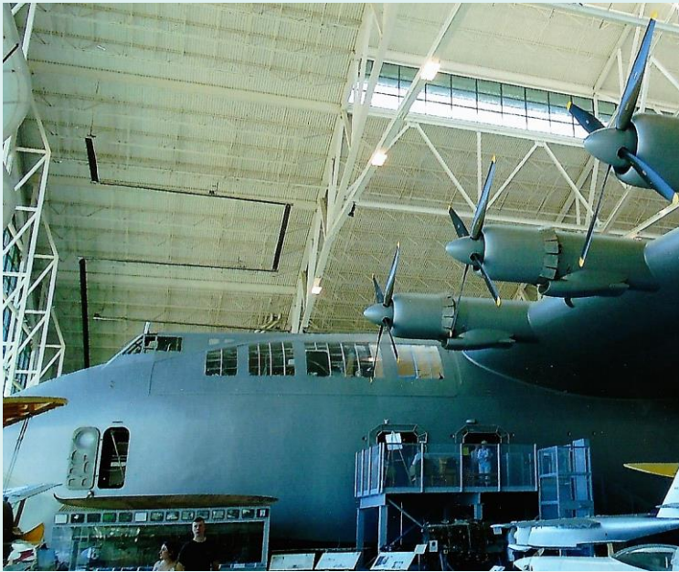
Evergreen Aviation Museums crown jewel, the Howard Hughes “Spruce Goose”.