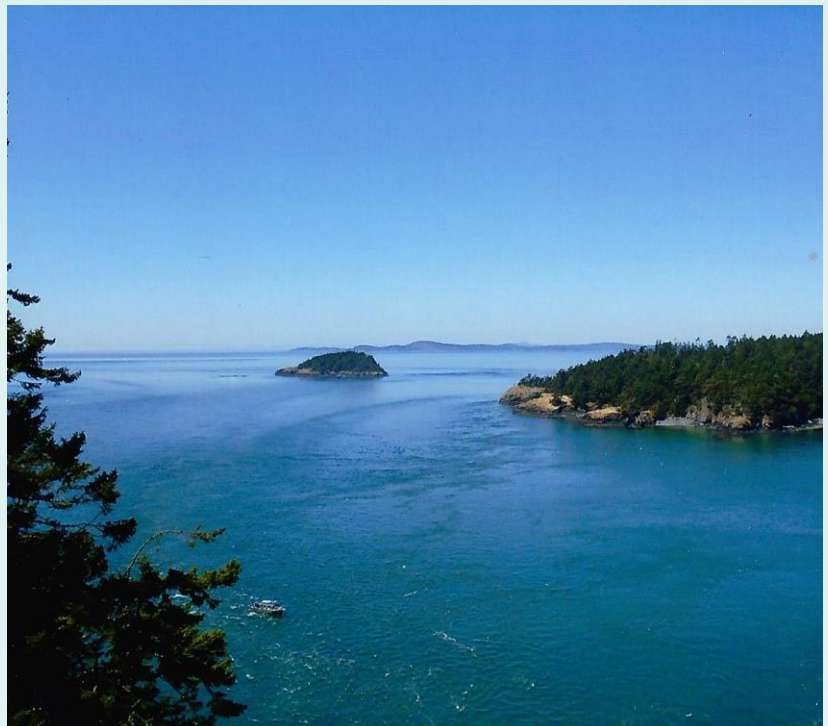
Deception Pass, Whidbey Island.