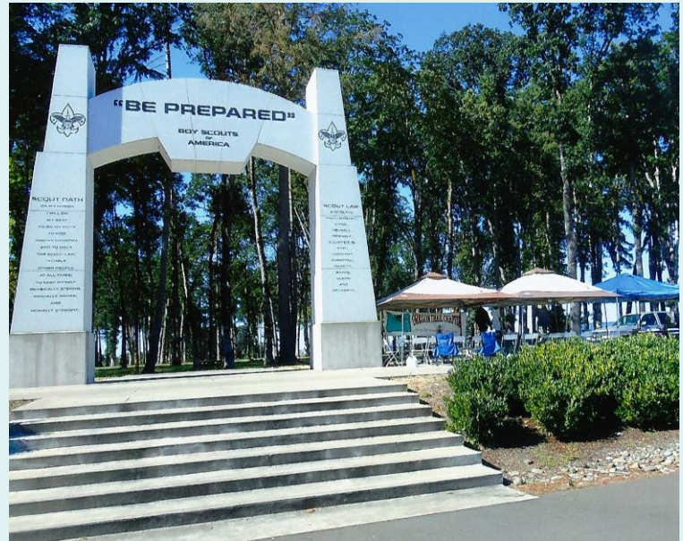
Oregon Trails' Road Run HQ.