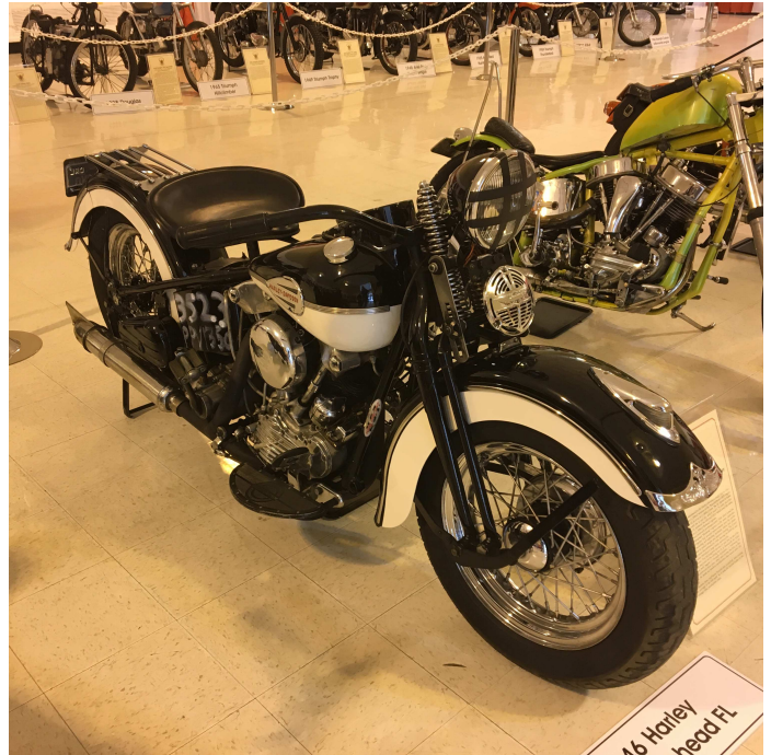
Tim McLaughlin's 1946 Harley FLA 2016 Bonneville Record holder in the vintage bike production class! 86.906 average mph