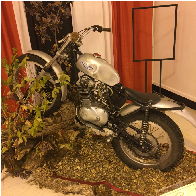
Check out Rich Hardmeyer's 1965 Triumph Tiger Trials bike on a unique indoor display!