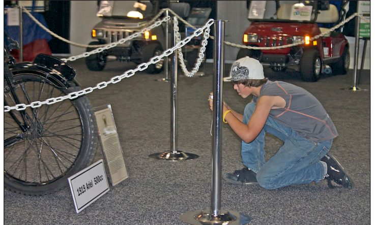
Most folks were trying to take picture of the bikes, this fellow was more interested in photographing the information sheet.