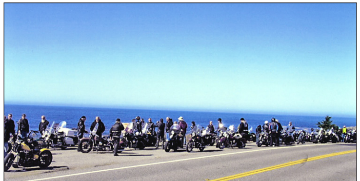
A few riders taking a break south of Jenner on the coast road. Great weather!