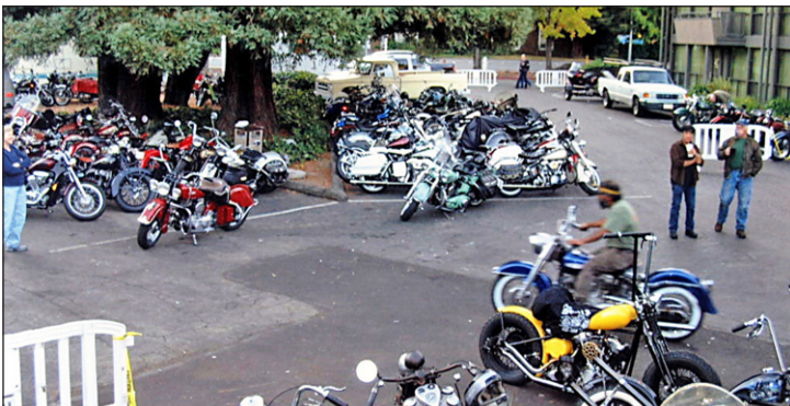
The parking lot at the Flamingo Hotel in Santa Rosa.