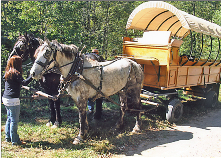
Our mode of transport on day three. Two horsepower!

We all had a great time with good friends, great scenic roads and excellent machinery. So save your money, spread the burden amongst good friends and try to take in a road run some place you’ve never been. Life moves too fast not to. Next year. . . Kentucky!