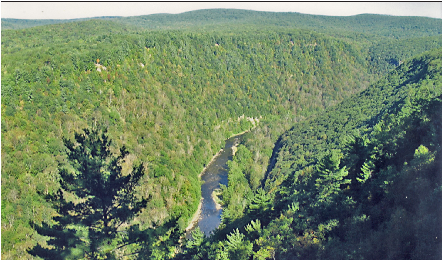
A spectacular view of Pennsylvania’s “Grand Canyon”. Completely clear cut at the turn of the century, it was replanted by the CCC during the depression. Trees can be a renewable resource.