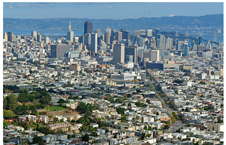
Whether looking across the bay from Fort Point or looking east from Twin Peaks, the views were spectacular.