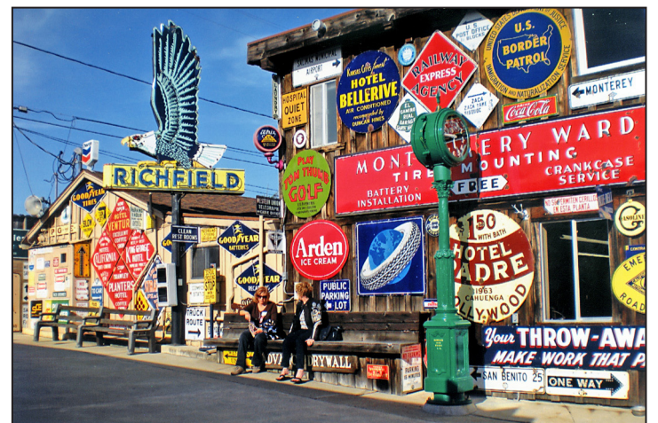
A small sampling of the porcelain signs on display at the Mendenhall museum.