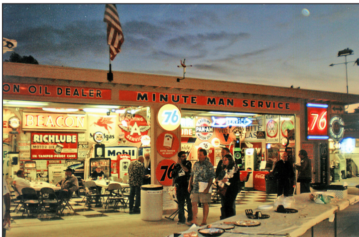
The banquet room.