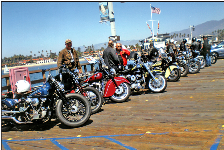
A small portion of the rider's machines at rest on the Santa Barbara pier.