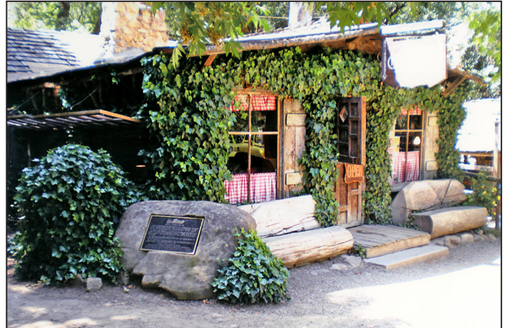
The Cold Springs Tavern atop San Marcos Pass a 100 year old stage coach stop.