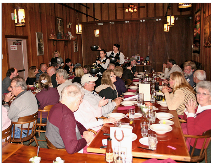
Some of the over thirty people who enjoyed the new location and menu at Cattlemans in Rancho Cordova.