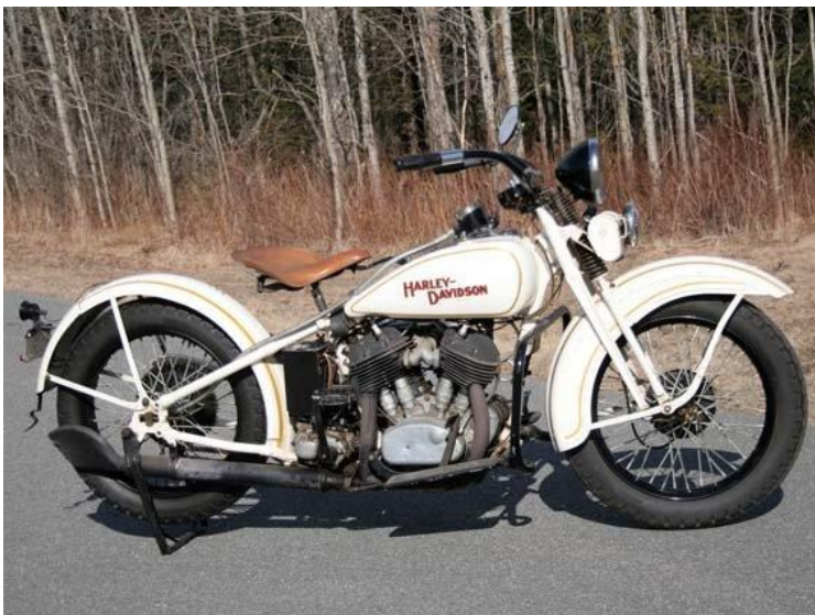
1932 Harley Davidson