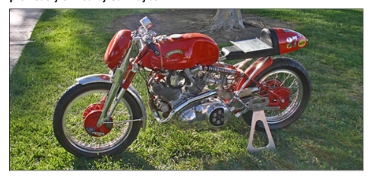
From one end of the speed scale to the other: Besides the 1899 Pugeot Laryr Feece also brought a 1946 Vincent road racer.