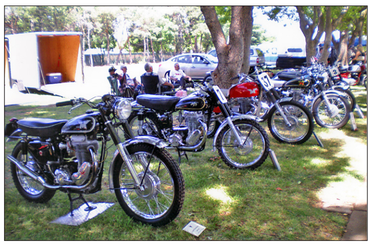
More of the Matchless/AJS collection.