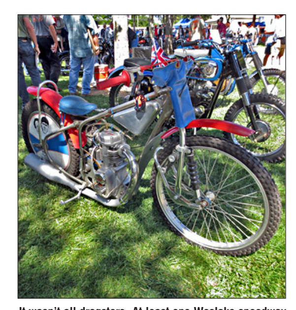
It wasn't all dragsters. At least one Weslake speedway bike showed up.