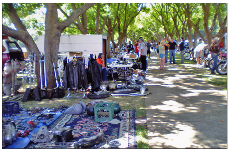
A view down the well shaded vendors row.