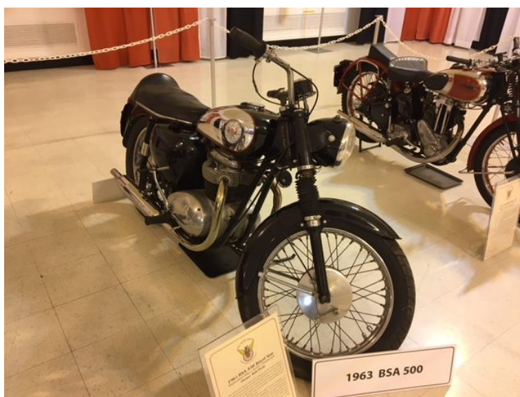
Bob Spratt's 1963 BSA 500 (A50 Royal Star)