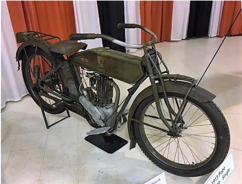
1915 Pope Model M Owner Wes Allen