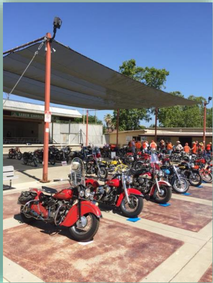
Look at all the Harley Davidson's being Judged!