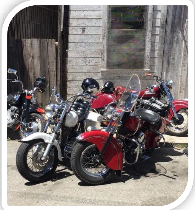
Classic picture of Indians etc. at Al the Wops