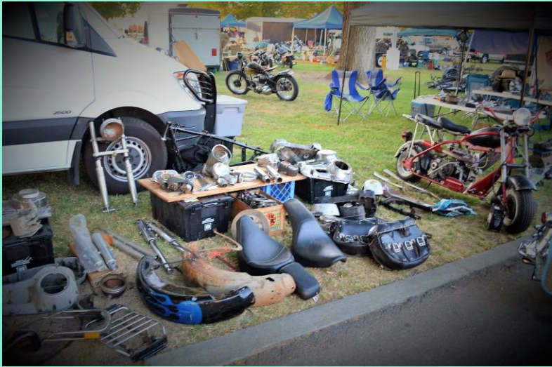
A true Swap Meet has the parts you are looking for! Dixon 2018 provided 166 vendors offering everything you would need to begin or complete a restoration.