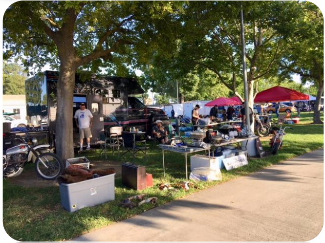
166 Vendors were there to provide that special part you have been looking for!