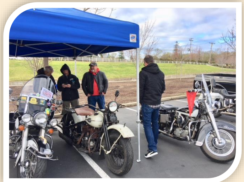
Fort Sutter Members at the EZ Up Where Jackets were needed all day!