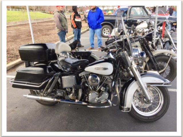
Rich Ostrander's trusty '67 FLH