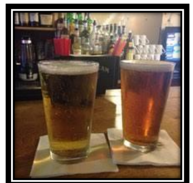
Food and refreshment.....officer, we only had the patty melt and coffee....Honest