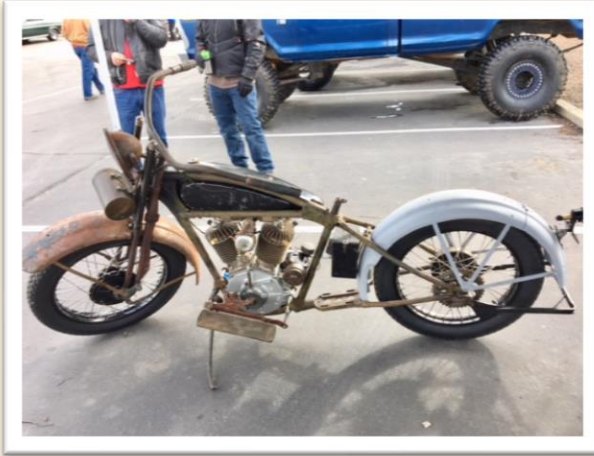
Tim McLaughlin's 1928 Harley JD "project bike" Looking good with it's motor now completed...stay tuned!