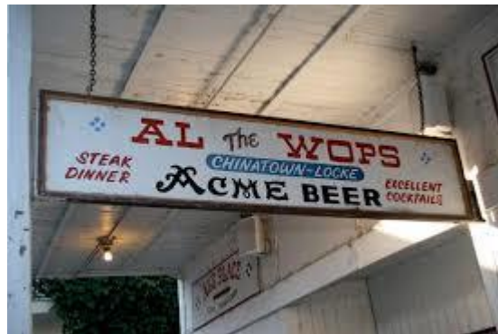
Lunch at "Al the Wops" .