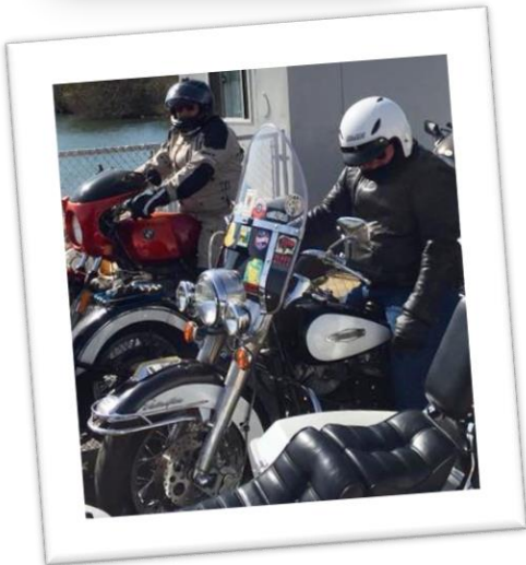
The group approaches and rolls aboard the Island Ferry.....If you haven't crossed the ferry(s) you are missing an interesting short trip across.