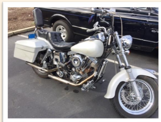
Tracy Stahlman's '76 HD FXE