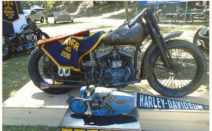
Another Cyclemo's creation. A 45" flathead that also win it's class at the TROG race. Nasty!