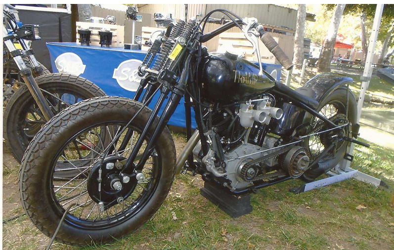
Replica of George Smith's (founder of S&S) early 50's drag bike. Dual Riley carbs

P.S. The Western version of the TROG will be held on Pismo Beach this October, 2016 featuring period cars and motorcycles just as they were raced there back in the 20's - 30's