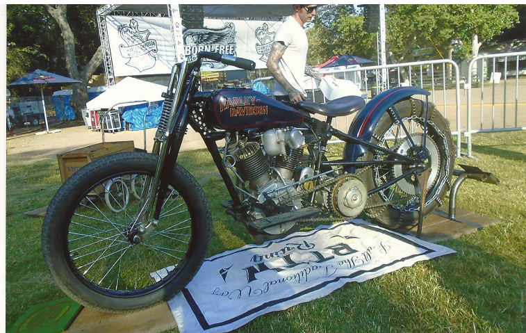
A young builder built this JDF riley carbed methenol/nitrol burning H-D hill climb replica.