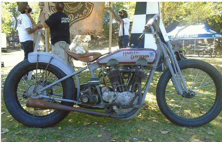
Old Crow Garages nice JDH cut down