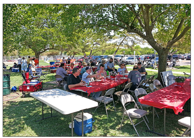
Lunch in the shade under the trees. Perfect!