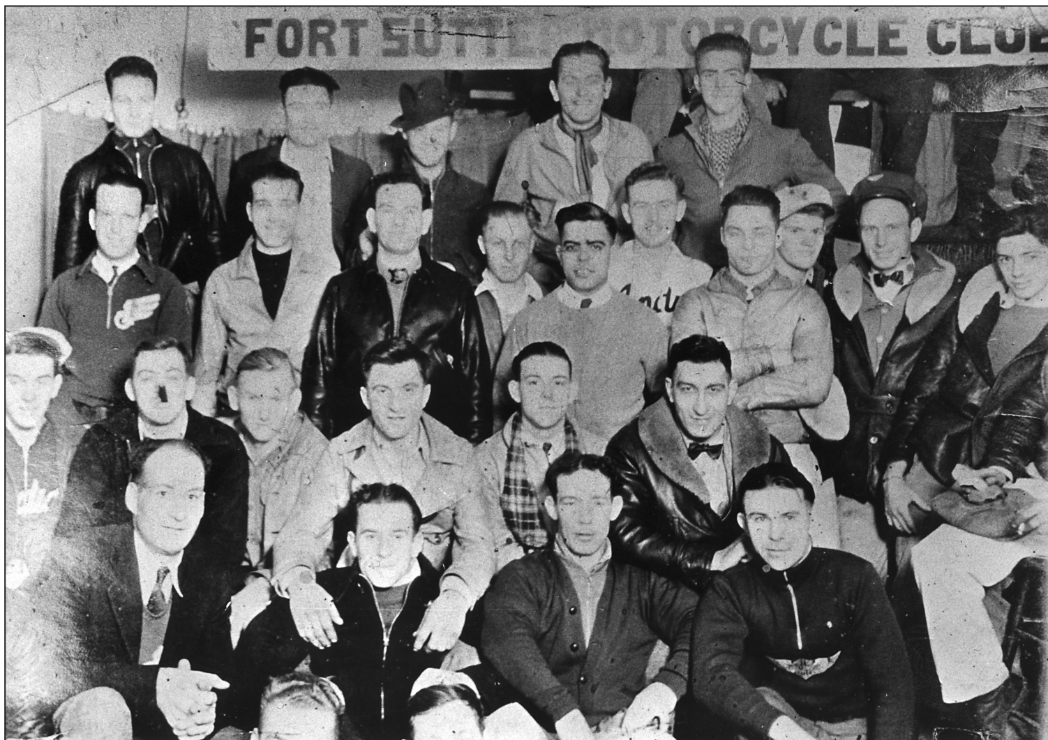
FORT SUTTER MOTORCYCLE CLUB MEMBERS taken at club room, Marionette Cafe, 13th & K Streets, Sacramento in 1935

The typewritten caption, duplicated below, was carefully pasted to the back of the framed picture along with the poem, "The Man in the Iron Shoe."