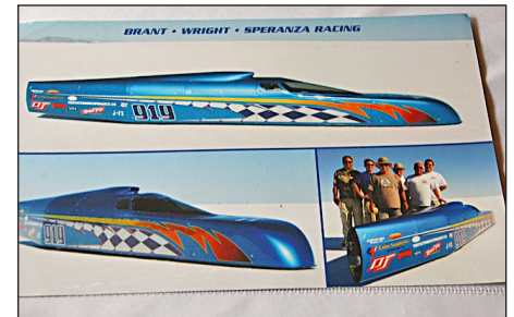
Pictures from the Brant photo album showing the streamliner at Bonneville.

Our Next Meeting Will Be SATURDAY, JUNE 7