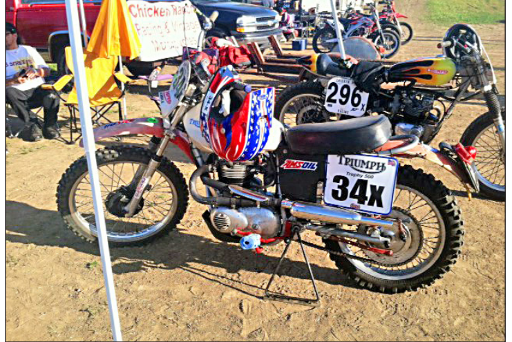
Running the Lodi Cycle Bowl with knobbies is not approved of by the AMA—That's the American MEDICAL Association.