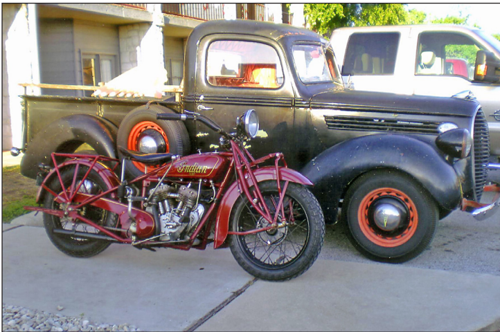
A representative of the "New" Indian Company drove in this 1938 Ford pickup with an early 283 Chevrolet engine under the hood. (That's not his 1930 101 Scout.)