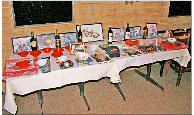
Rich also came up with a terrific assortment of raffle prizes.