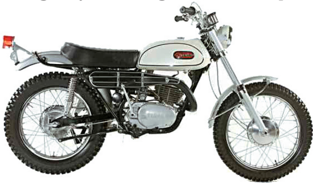
Honoring Japanese Bikes • All Makes and Models