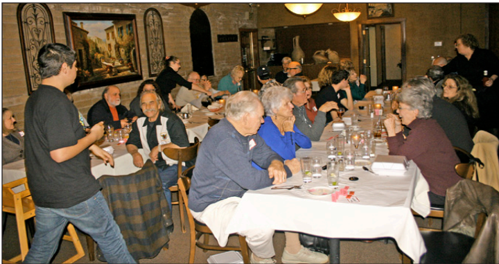
Part of the small but enthusiastic crowd.