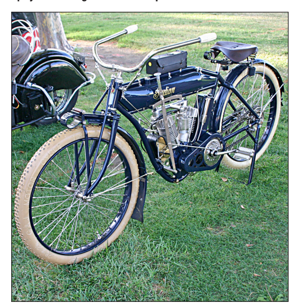
Bob Clift's 1911 Indian Little Twin took oldest bike honors.