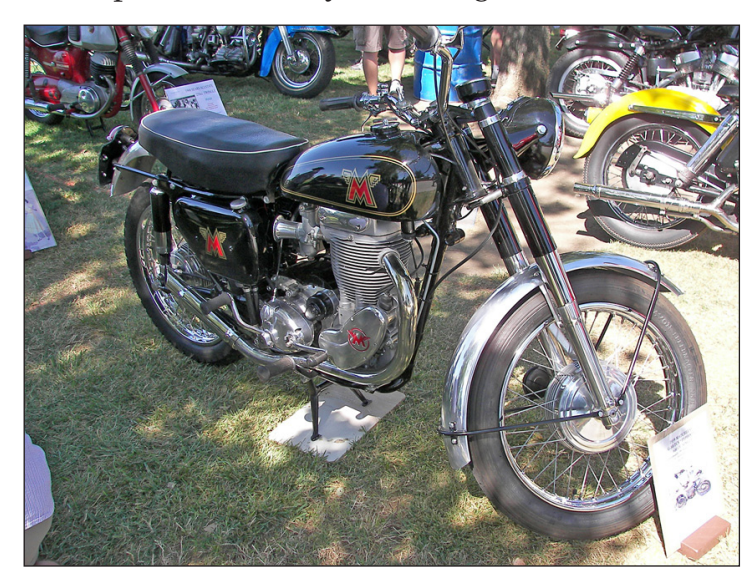
Don Martin's beautiful 1959 Matchless G80 Typhoon.

Hope to see all of you back again next Father's Day weekend.