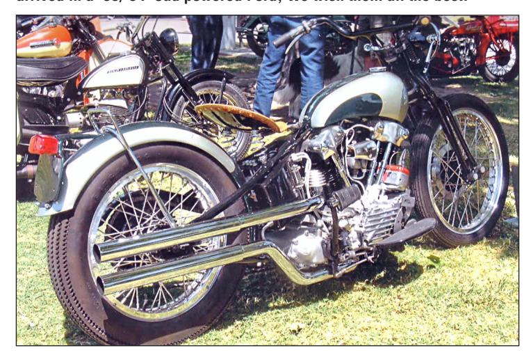
Fist place in "Period Modified" went to Jim Trochet's freshly finished, VL framed '46 knucklehead