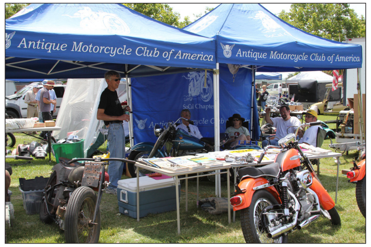
...as well as the Southern California Chapter.