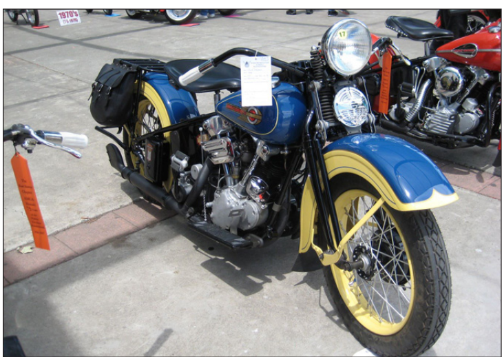
Another beautifully restored Knucklehead was Chuck Sherman's 1936 EL.