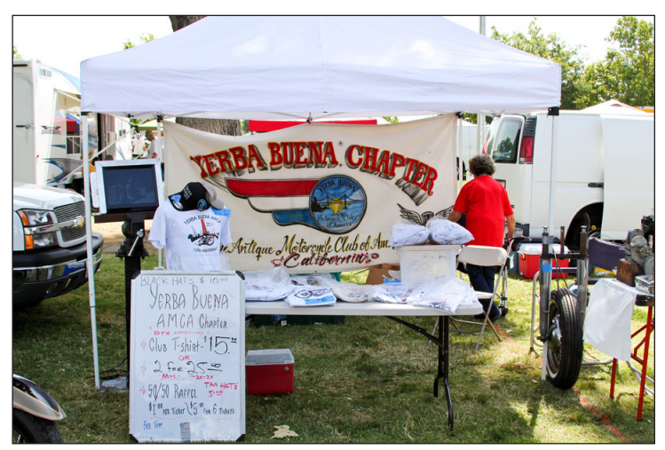
Among the other AMCA chapters helping to make the meet a success was the Yerba Buena Chapter. . .